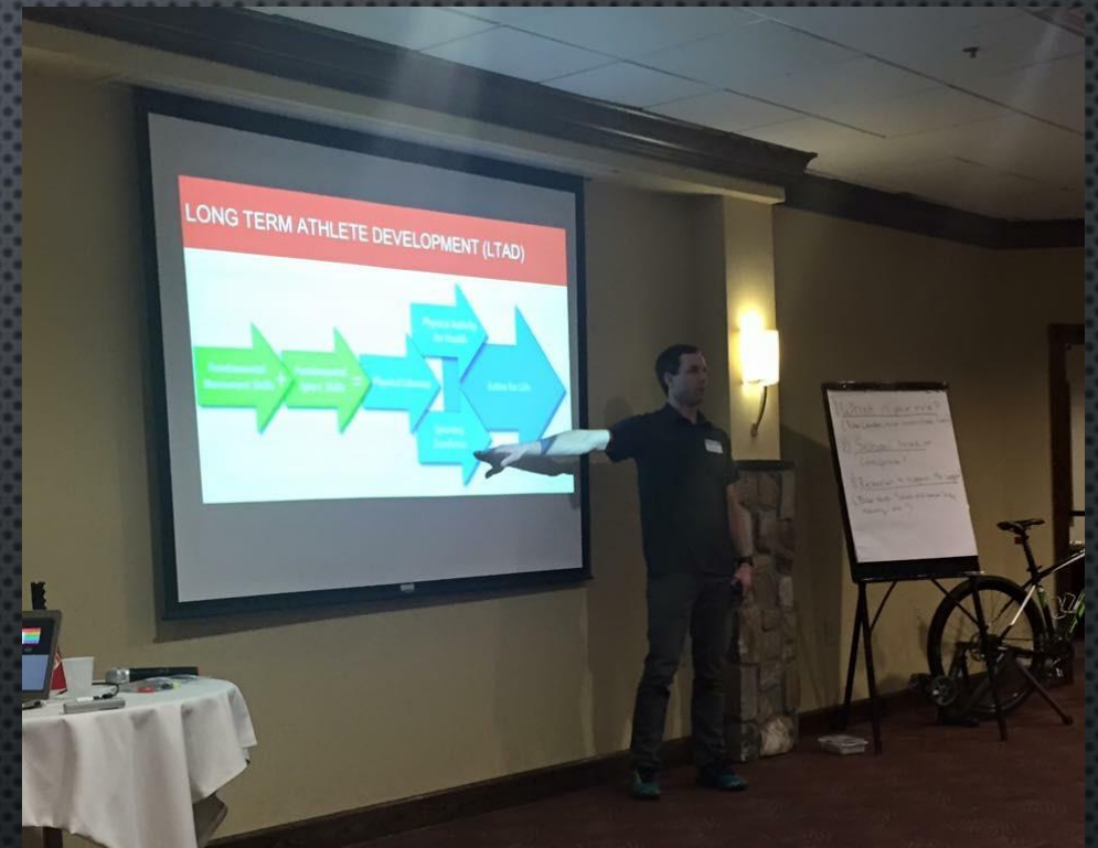
2016 PICL Leaders' Summit

We have a copy of our insurance policy if you would like to look at it as well.